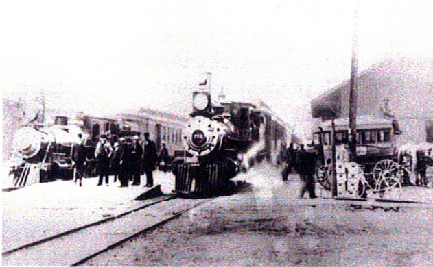
This photograph is of the Chicago, Milwaukee and Saint Paul train and depot at Mitchell in 1901.

More than 66 percent of the work of the Society is funded by grants, donations, memberships, and user fees. As a result, the partnership between the Society and Foundation, and your donor and member support is even more important. Your continued support helps make sure projects and the work of the State Historical Society will be achieved. Doane Robinson, the first secretary of the Historical Society in 1902, commented: "It seems scarcely necessary to argue the value of the work of a historical society from the standpoint of education and good citizen making. It seems a paradox that history of our own commonwealth should be neglected, or so scantily provided for, that research is crippled or carried forward at private expense." Today that need is no different. Donor and private funding are still critical in completing the work of the State Historical Society.